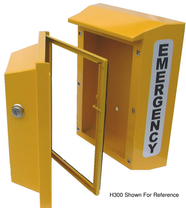
H300 Shown For Reference