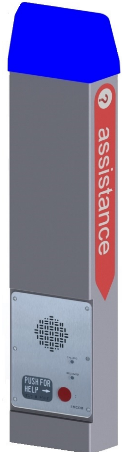
Shown with IP6000 (not included)